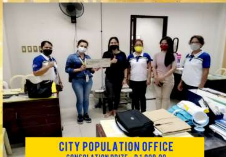
CITY POPULATION OFFICE CONSOLATION PRIZE - P 1,000.00