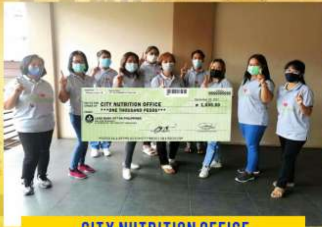
CITY NUTRITION OFFICE MOST CREATIVE - P 1,000.00 CONSOLATION PRIZE - P 1,000.00